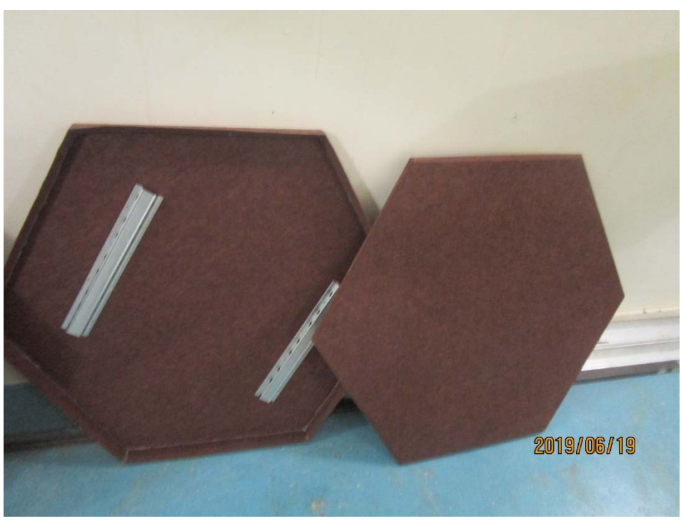
Figure 3 – Body and lid pieces, metal rails at body interior