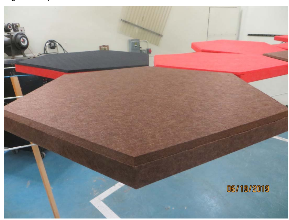
Figure 2 – Detail of individual assembled unit