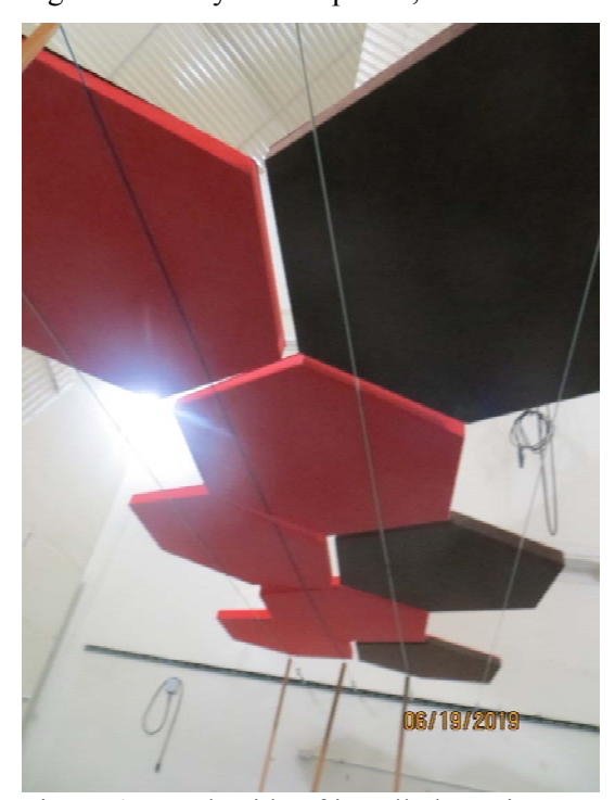
Figure 4 – Underside of installed specimen, spacing between units